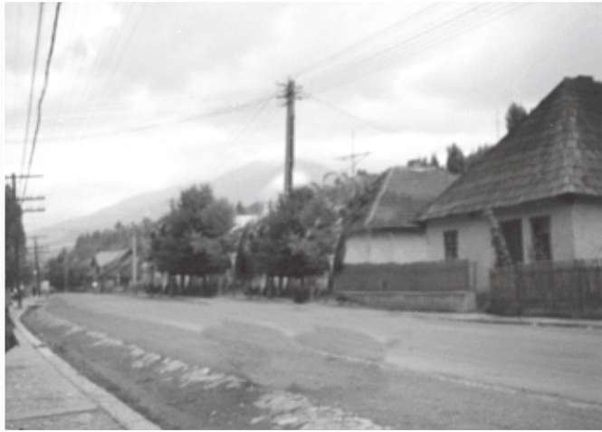
The main street in the town of Massif

sale trade of fruits, cattle and sheep, and established sawmills, flour mills, and more.