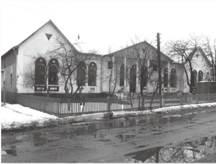
The home of the Tzemach Tzaddik in Vizhnitz

Harav Baruch of Vizhnitz, author of the sefer Imrei Baruch , who led his flock for just eight years before passing away at a young age. His son, Harav Yisrael of Vizhnitz, author of Ahavas Yisrael , was crowned as his successor.